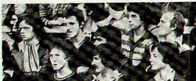
FAN OF THE WEEK: The supporter ringed in our picture home league match against Peterborough United on December 1st.

FREE INSURANCE WHEN TRAVELLING TO AWAY MATCHES