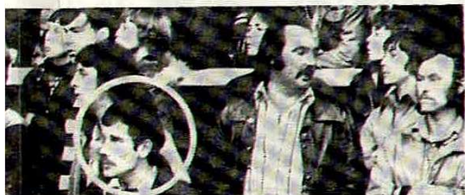
picture can claim two grandstand tickets for our next cember 26th if he identifies himself at the club office.